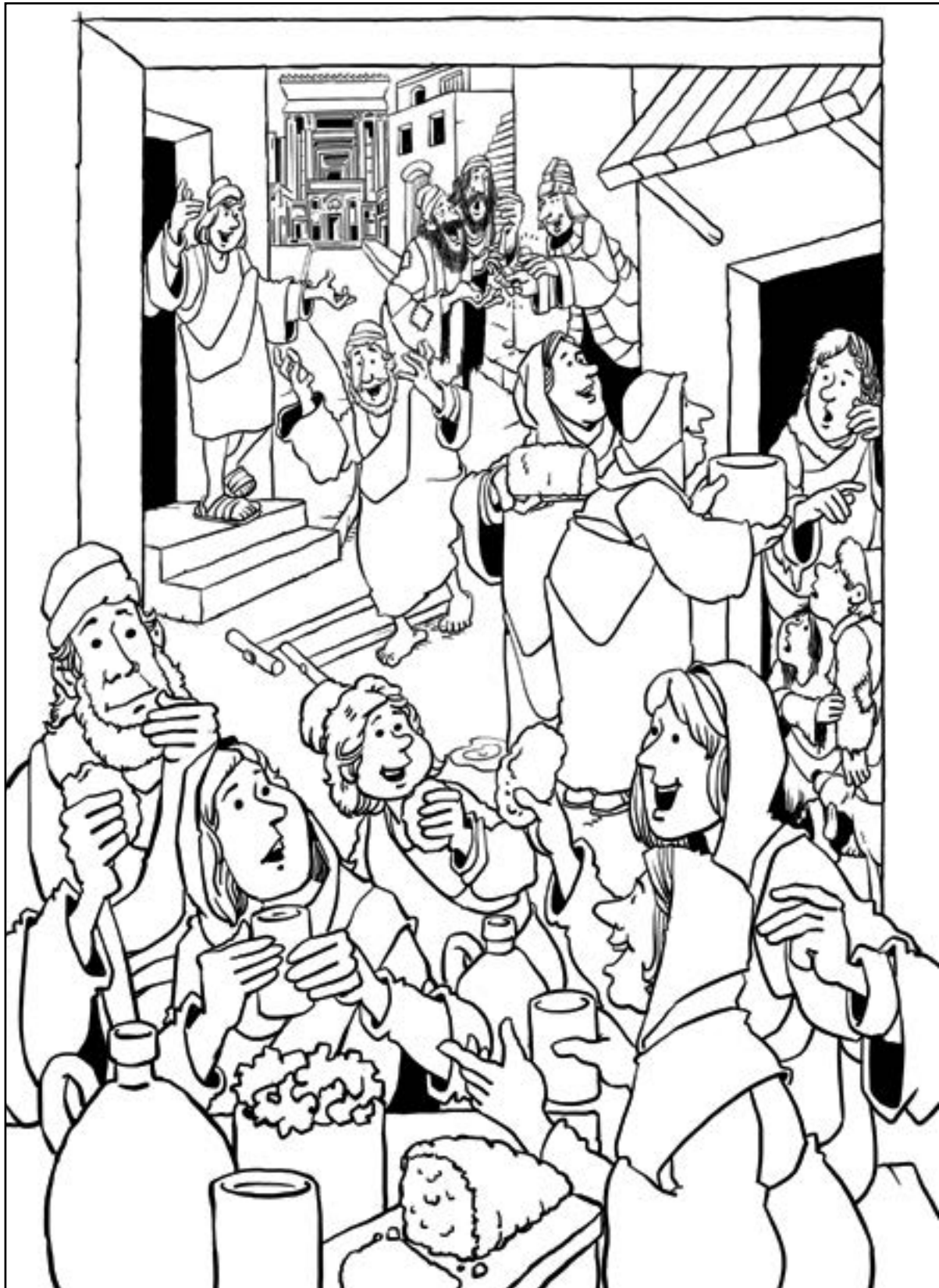
The followers of Jesus help one another.