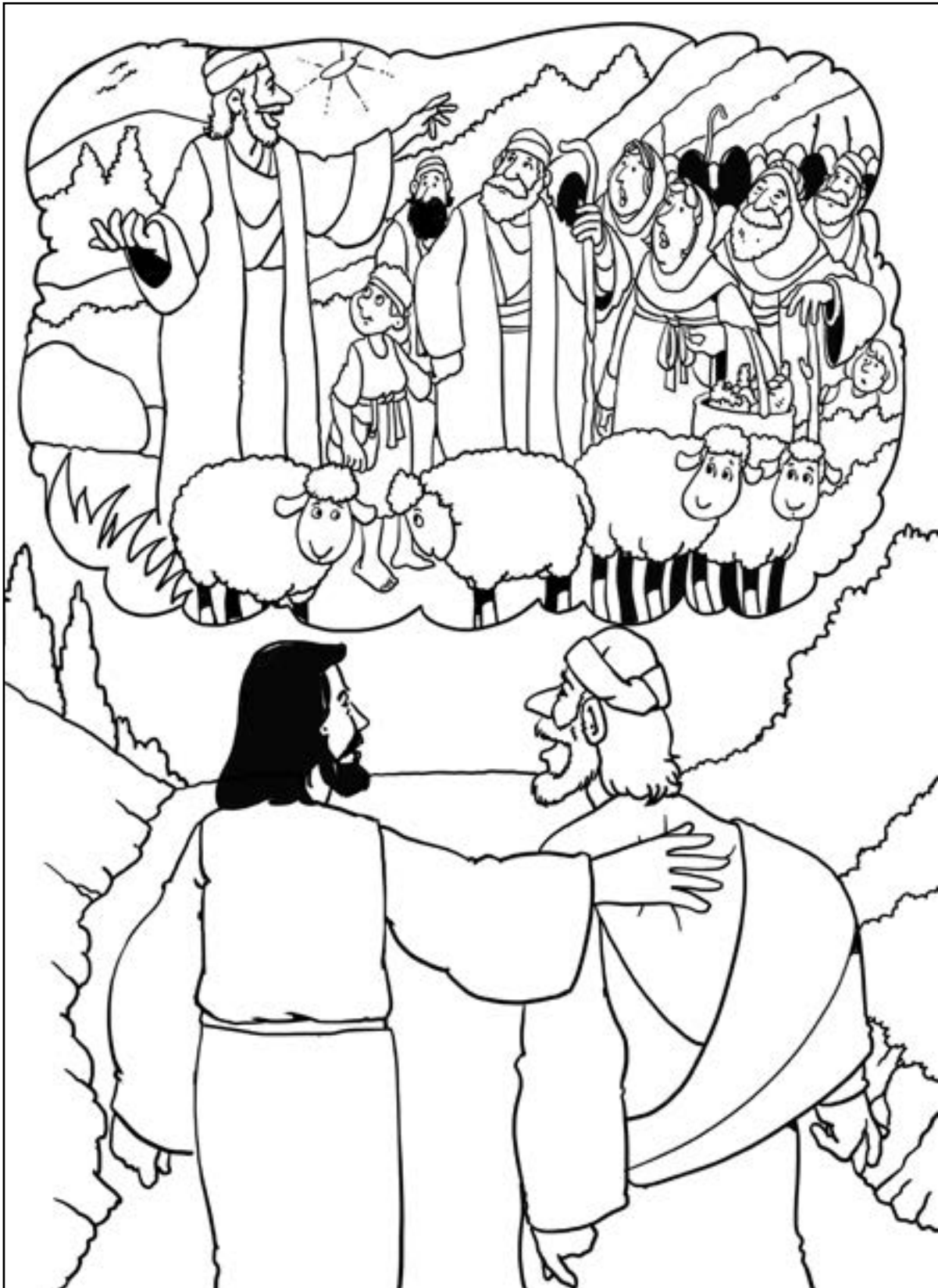
Jesus gave Peter a very important job to do.